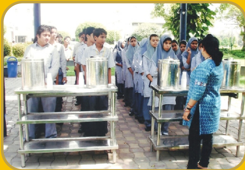
Mother Dairy Delhi

Trekking, mountaineering, camping, rock climbing etc are regular activities for our boys and girls. These are regularly organized for imparting hands on knowledge to the students.