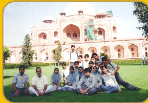
Humayun Tomb Delhi