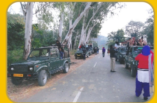
Jim Corbett Ramnagar