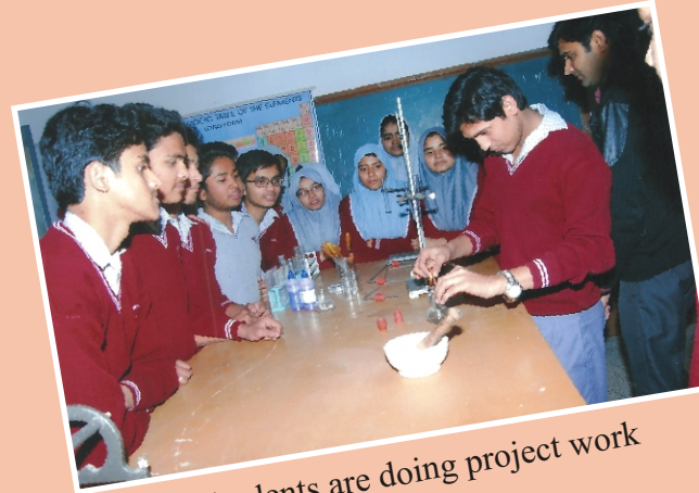
Students are doing project work